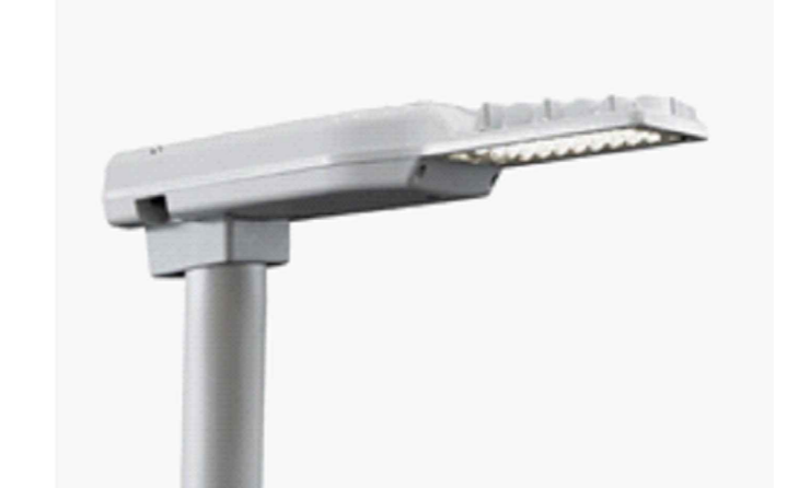
Exemplar Image of Lantern